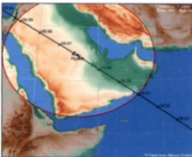
Figure 1 – Estimated Locations of Falling Debris